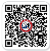
The National Action Alliance Guidelines

Speaking publicly about suicide can also decrease or increase risk for those who are struggling. It's OK to share your story with family, peers, counselors, etc., but when it goes out to the public, it is important to think of the message you deliver. When you are ready, TAPS can help you tell your story in a safe and strategic way. The National Action Alliance Guidelines for telling your own story is also helpful: